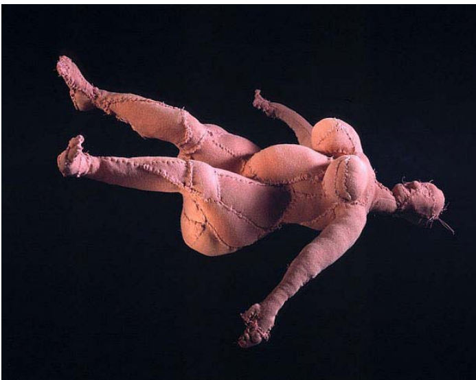
Top Left and Right: Claes Oldenburg Bottom Left: Louise Bourgeois